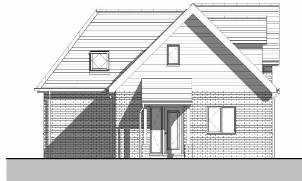
West 1 : 100

© The copyright of this drawing remains with Pro Vision and may not be reproduced in any form without prior written consent. Only scale from this drawing for the purposes of determining a planning application. Do not scale from this drawing for construction purposes. Any discrepancies between this and any other consultant's drawings should be reported to the Architect immediately. The contractor must check all dimensions before commencing work on site and all discrepancies reported to the Architect. No deviation from this drawing will be permitted without the prior consent of the Architect.