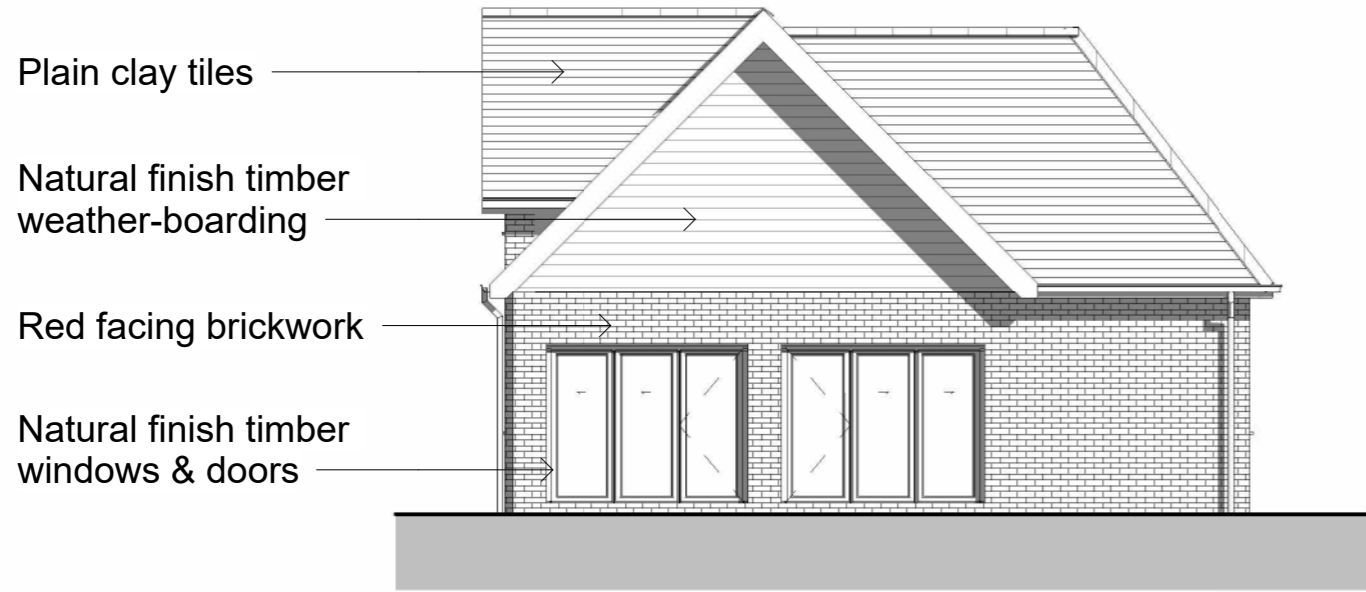
East 1 : 100