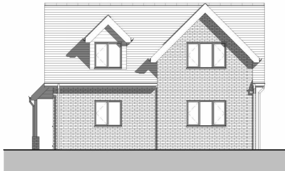
South 1 : 100